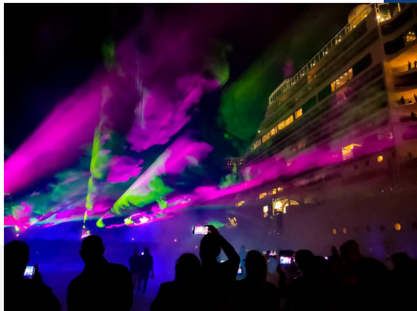
Lights, rock music, fire and water at the «Cruise Season Closing Ceremony» 2022 in the port of Taranto. Below the «Rock Port» logo

Watch the video here or click the QR Code: https://youtu.be/7h-xnJySPE