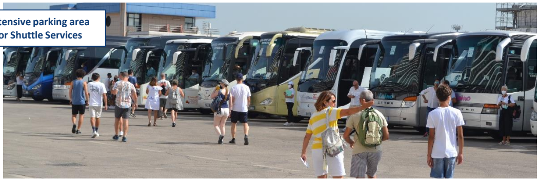
Extensive parking area for Shuttle Services

The collaboration with the TCP is a key factor in the success of the promotional strategy of the PNAIS as they offer supporting services to cruise passengers transiting in the port of Taranto as well as to all those who choose the Ionian port as a port of embarkation and disembarkation.